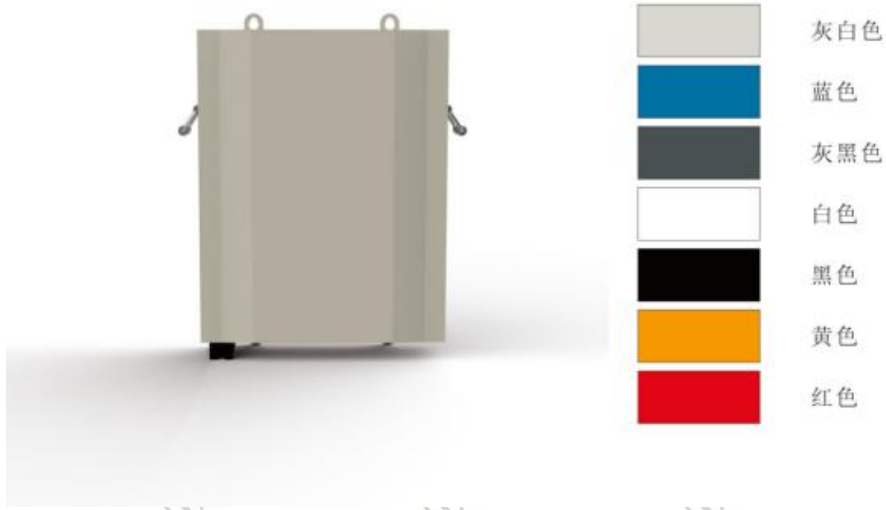
Figure 5 The battery color card (电池颜色卡)