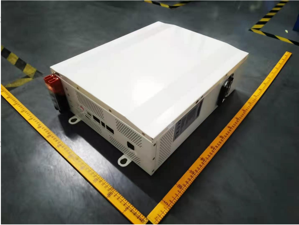
Figure 1 Overall view I of battery (电池图I)